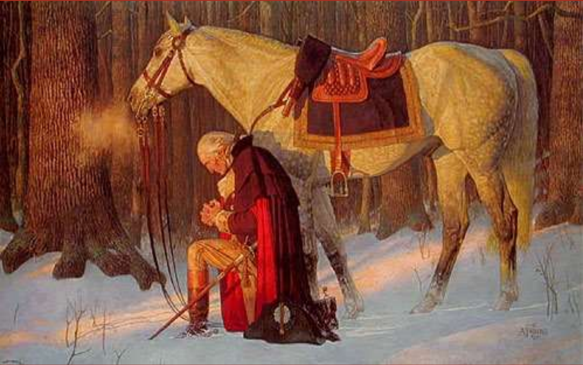
The Prayer at Valley Forge