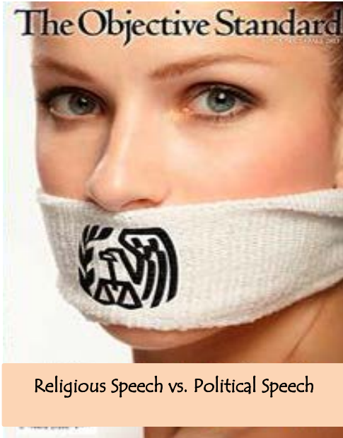
Religious Speech vs. Political Speech

Objective = Tangible Subjective = Intangible