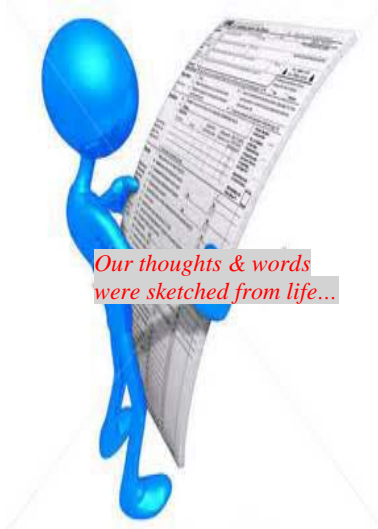
Our thoughts & words were sketched from life...