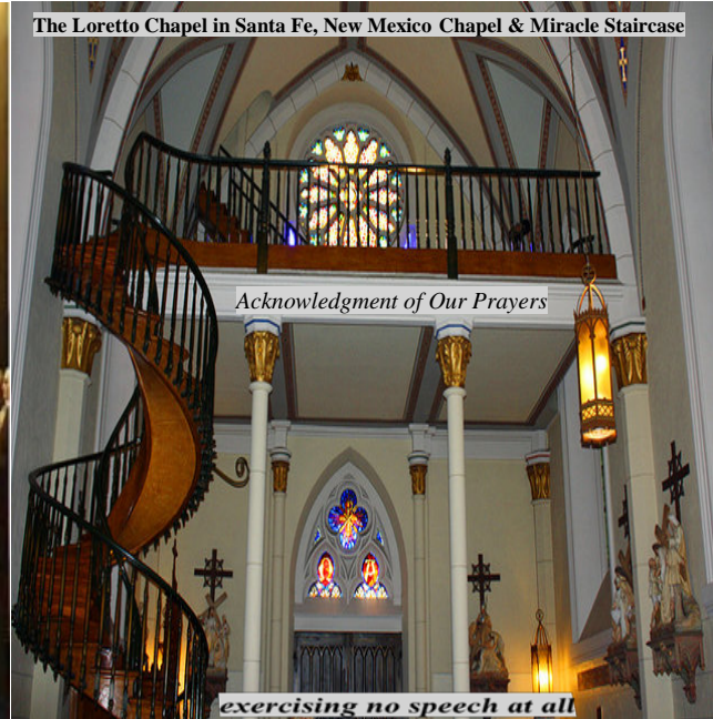
The Loretto Chapel in Santa Fe, New Mexico Chapel & Miracle Staircase