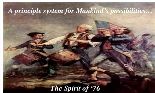
The Spirit of '76