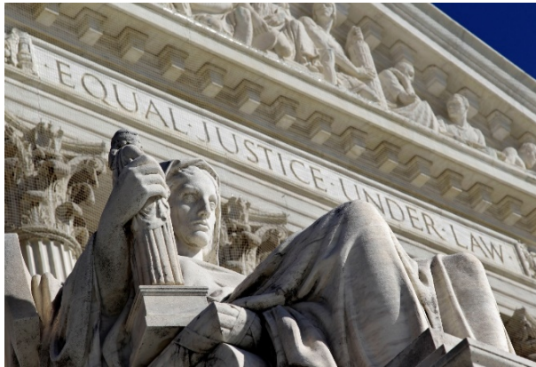
Free Exercise Clause Decision – The “Contemplation of Justice”