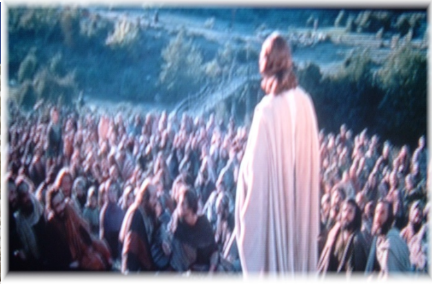
Free Exercise Clause Decision – The Laws of Principle and Practice