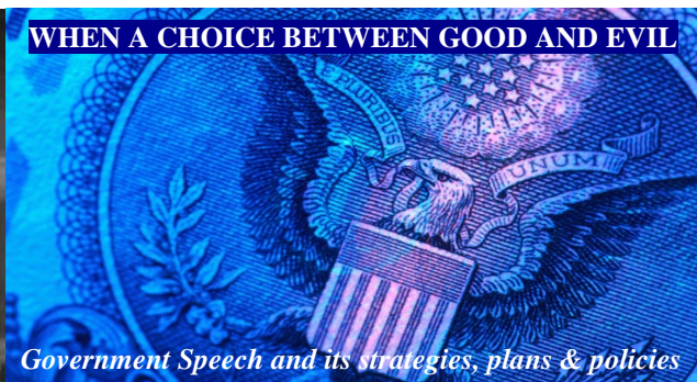
Government Speech and its strategies, plans & policies

Plaintiff's [conscience] dictates: The purpose of Defendants' decisions in [The Policy] is to make property and nothing but property of the working class people in all States of the Union. Plaintiff [believes] with all his heart and soul: “A house divided against itself cannot stand. This government cannot endure permanently half slave and half free.” as Abraham Lincoln declared in a large number of core political speeches seen as (Raymond Massey) in the role of: Abe Lincoln in Illinois, (1940):