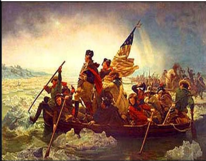
An Act of Faith