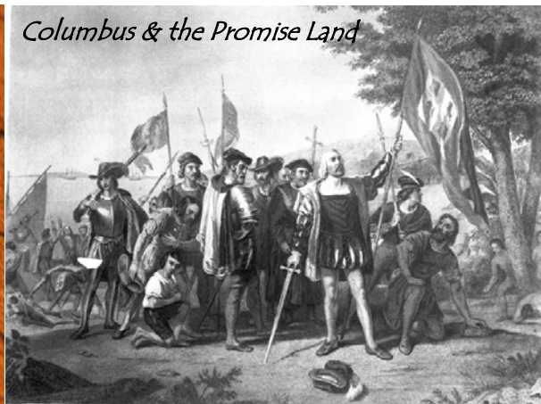
Columbus & the Promise Land